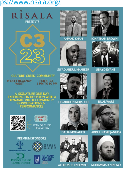
Risala Event program